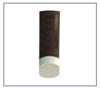
Clenil 100mcg inhaler from a regular batch